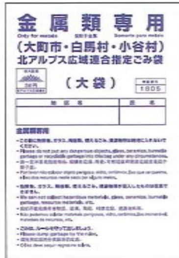
《Garbage bag for metal》